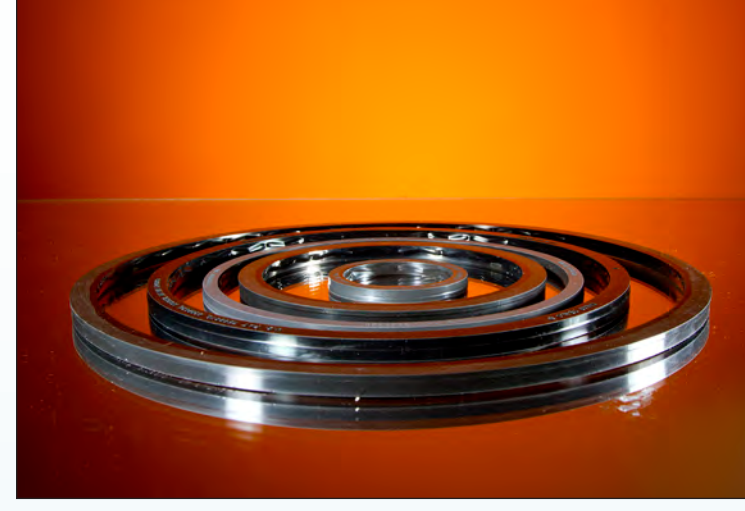
Kalsi Seals are available in many sizes & materials.

environment, they provide an effective solution to the severe service conditions found in many different industries.