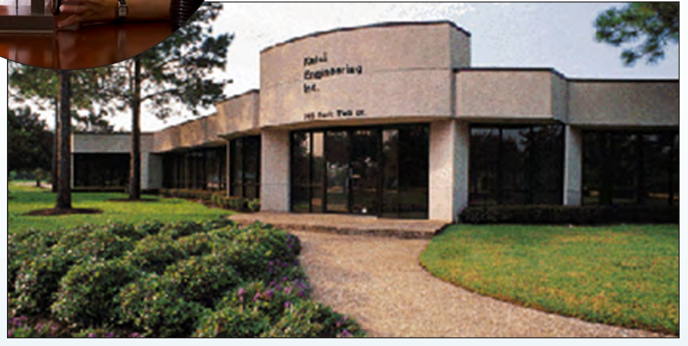
Kalsi Engineering is located in the Houston, Texas metropolitan area.

Kalsi Seals are thoroughly inspected to assure conformance to our demanding design specifications.