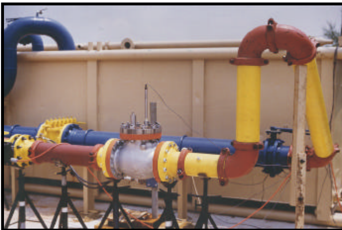
Flow loop can be rapidly reconfigured to simulate in-plant piping configurations

Increase margins through innovative mechanical and flow loop testing